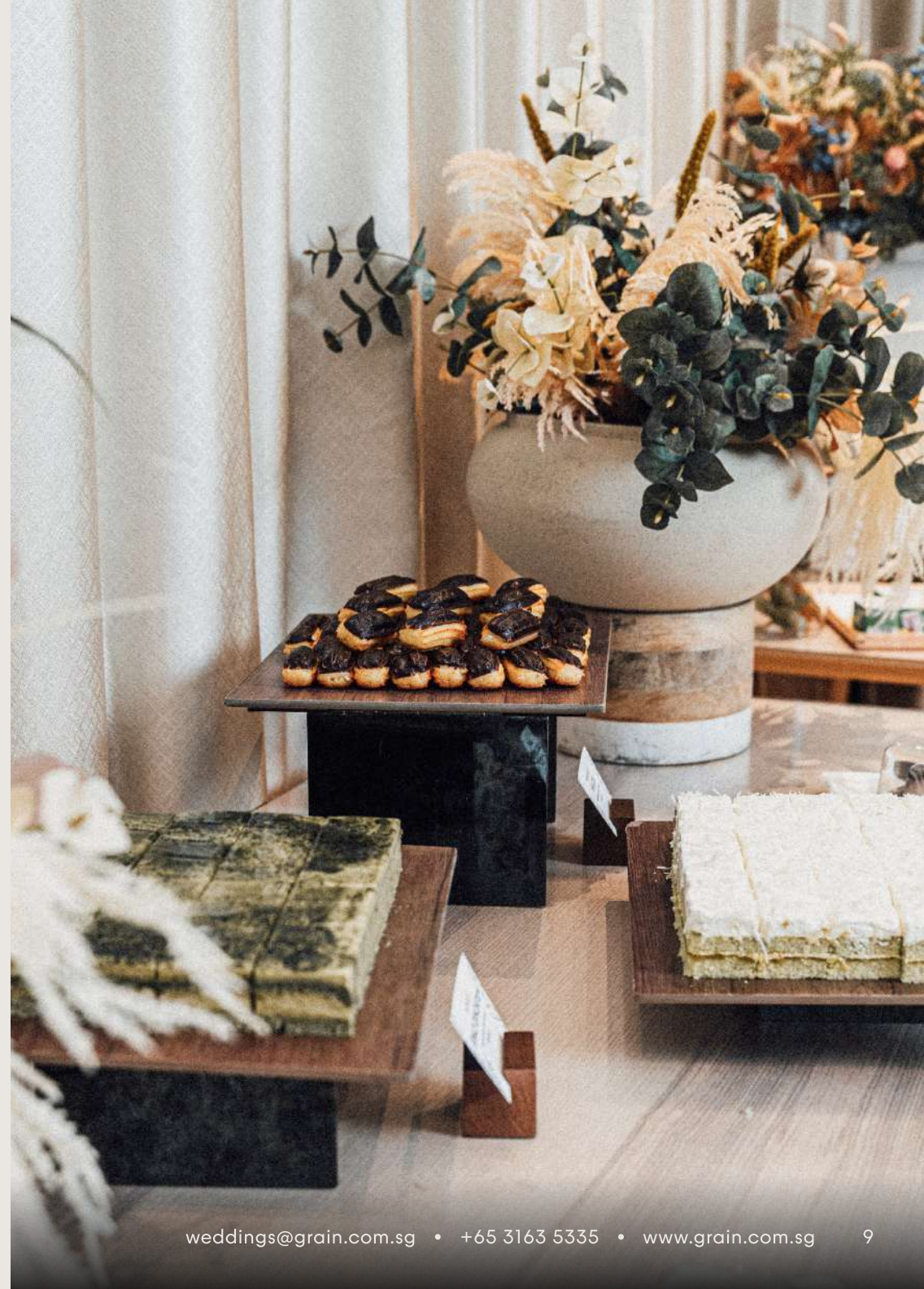
Table setup with centrepiece